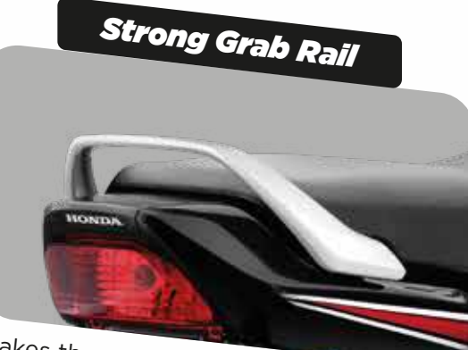
Makes the motorcycle elegant and practical.