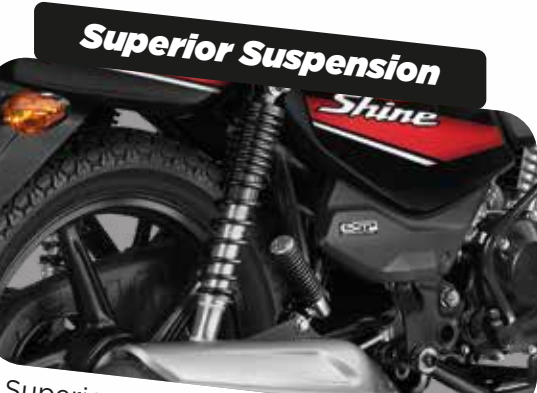
Superior suspension makes driving easy on all kinds of roads.