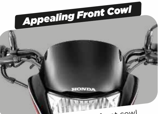
Magnificent aerodynamic front cowl and attractive headlamp.

Beautiful tank and side graphics increase your shine.