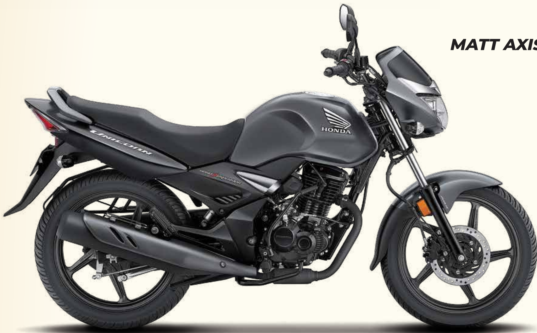
MATT AXIS GREY METALLIC